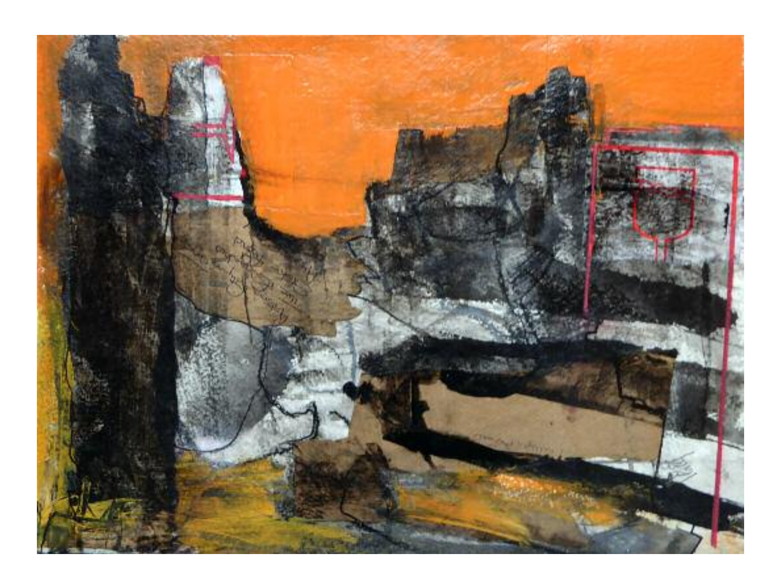
Study for Rock Formations (Utah) Mixed Media 28 x 38 cms