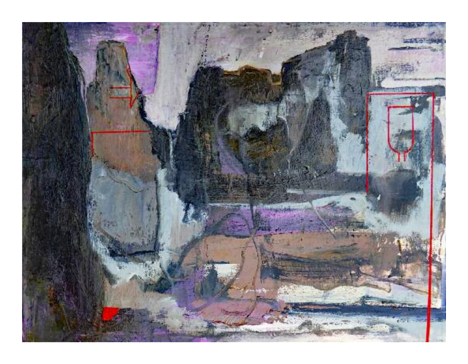
Rock Formations IV (Utah) Mixed Media 46 x 61 cms