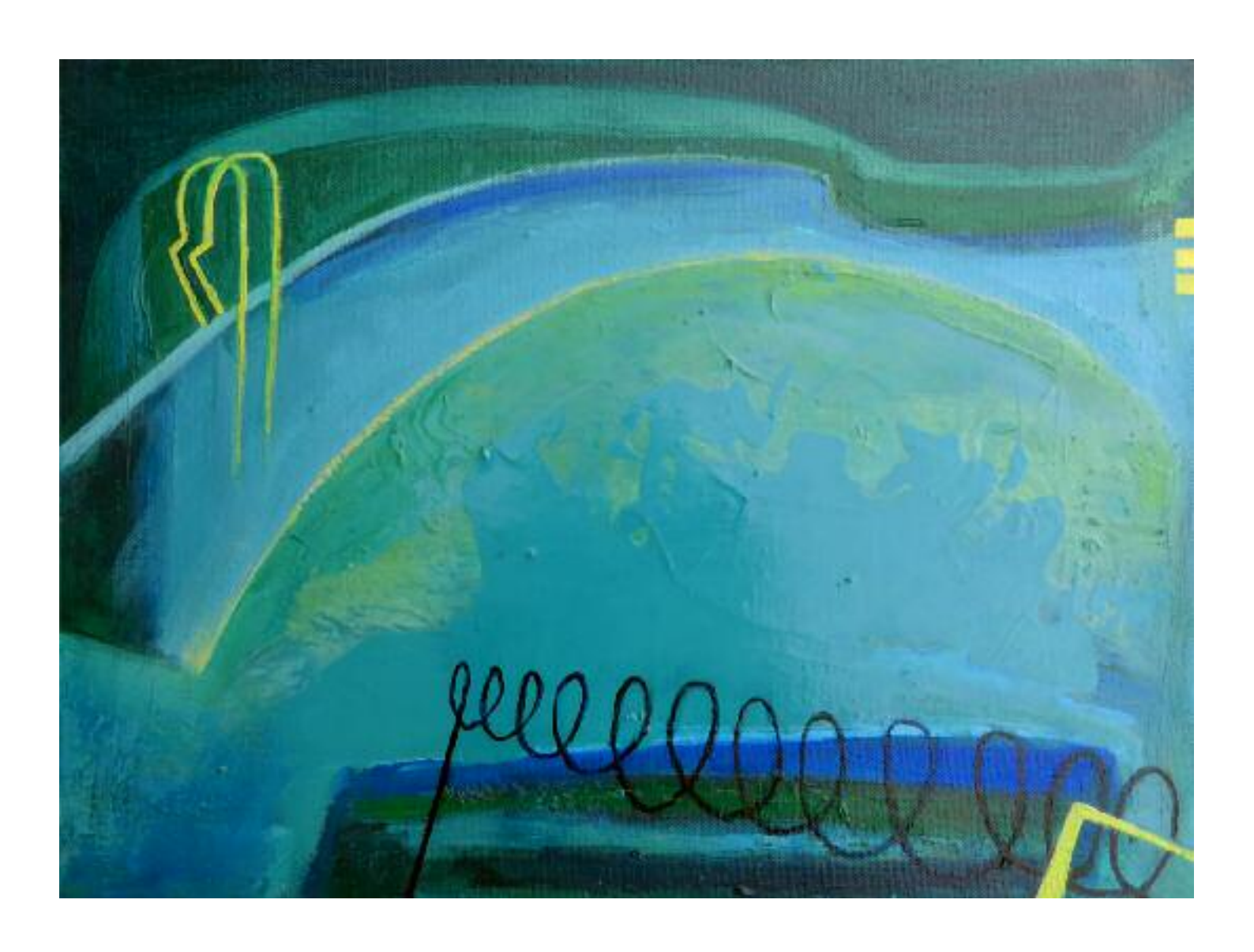
Geothermal Pool III (Penzance Lido, Cornwall) Oil 30 x 40 cms