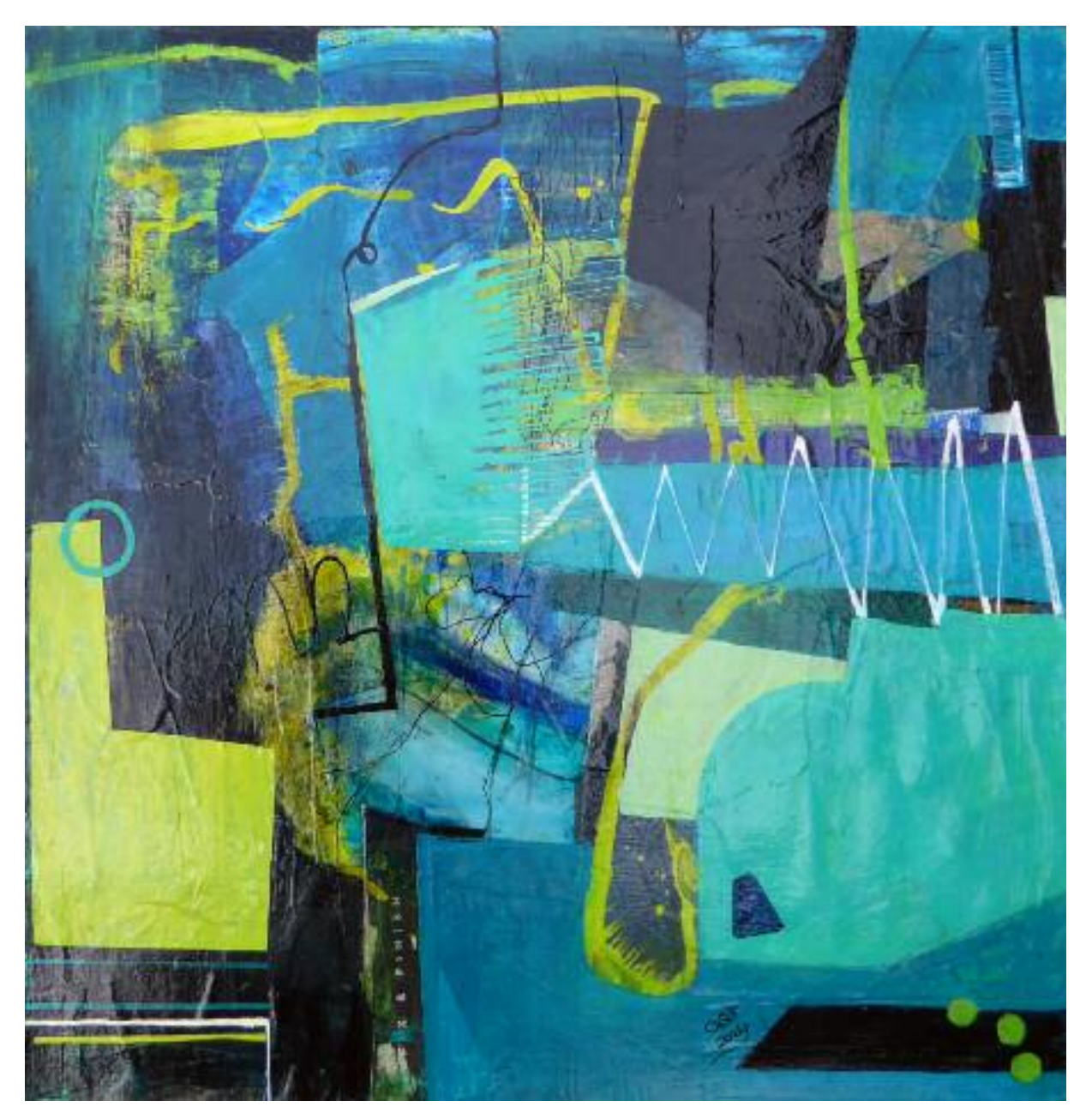
Daydreaming of the Sea Mixed Media 45 x 45cms