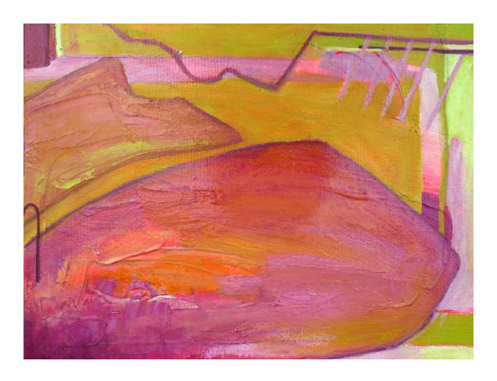
Geothermal Pool I (Penzance Lido, Cornwall) Oil 30 x 40 cms