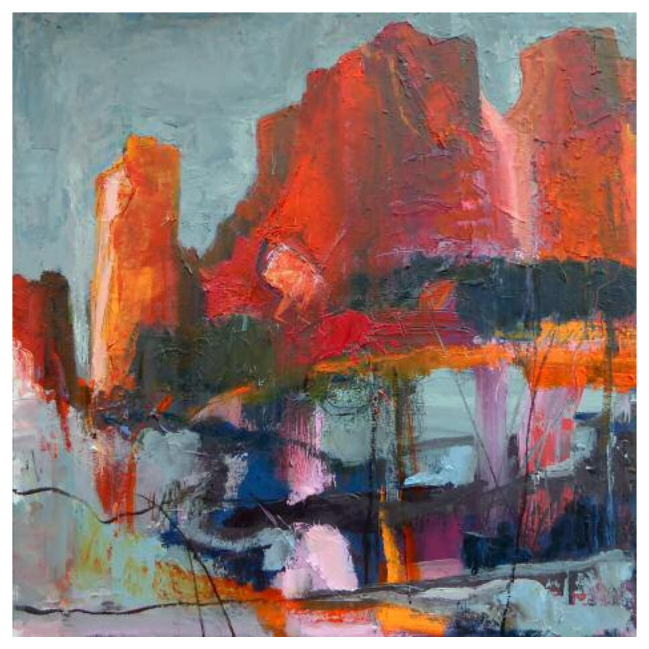
Rock Formations II (Utah) Oil 70 x 70 cms