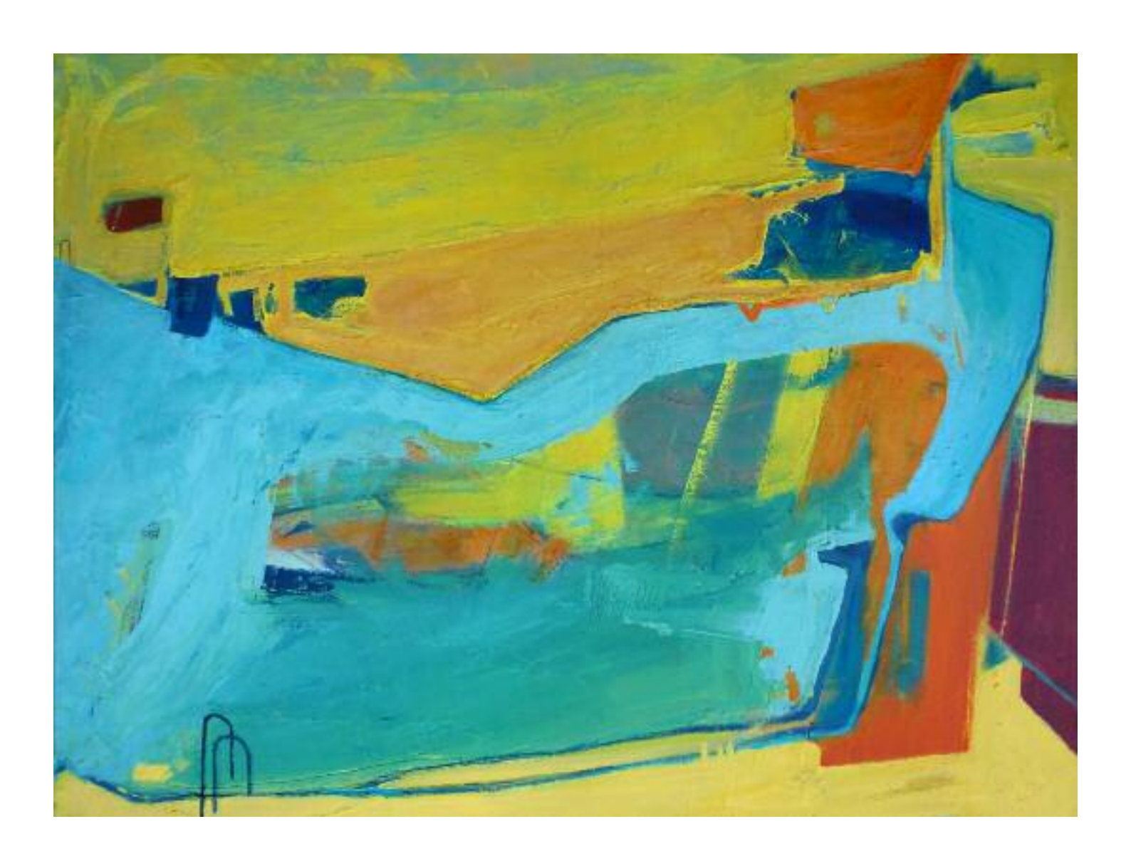
Sea Pool II (Bude, Cornwall) Oil 60 x 80 cms