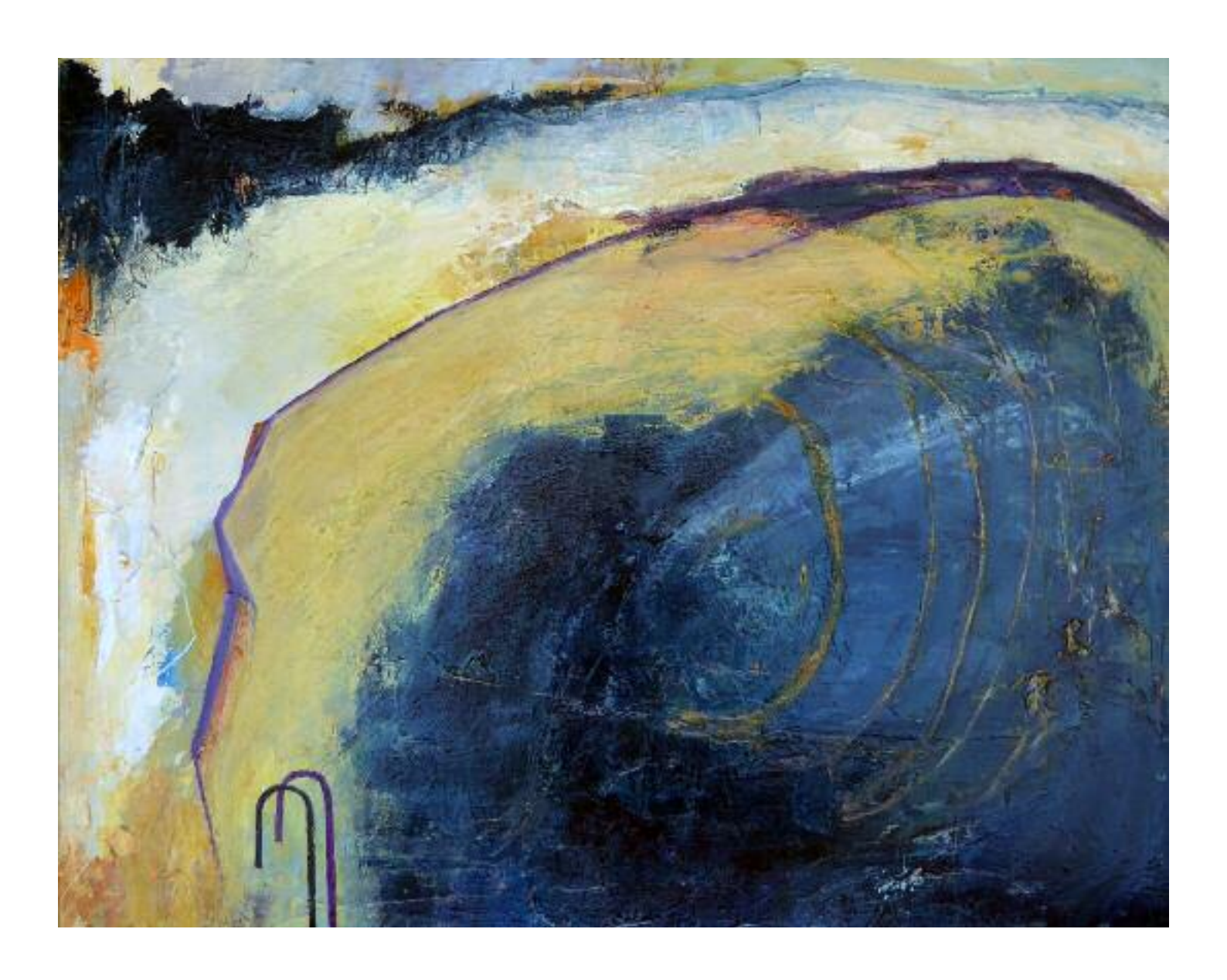
Sea Pool VI, with Ripples (Bude, Cornwall) Oil 60 x 76 cms