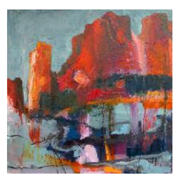
Rock Formations II (Utah) Oil 70 x 70 cms

POOLS — "As a lifelong swimmer and ex water polo player, swimming pools have always been wonderful places for me especially if they are outdoors, as well of course, as the sea. In Cornwall there are two outdoor pools that have inspired me in particular — the tidal sea water swimming pool in Bude, and the Lido in Penzance which as well as having a large seawater pool has a fabulous little geothermal pool as well. The Bude pool is fed by the sea at high tide, it is over 45m long and quite elemental as it is built into the cliff face. The Lido in Penzance is more contained and the memories of floating in the geothermal pool in the freezing wind and rain surrounded by the art deco design, with the added plus of the sound of the sea all around, are also inspiring".