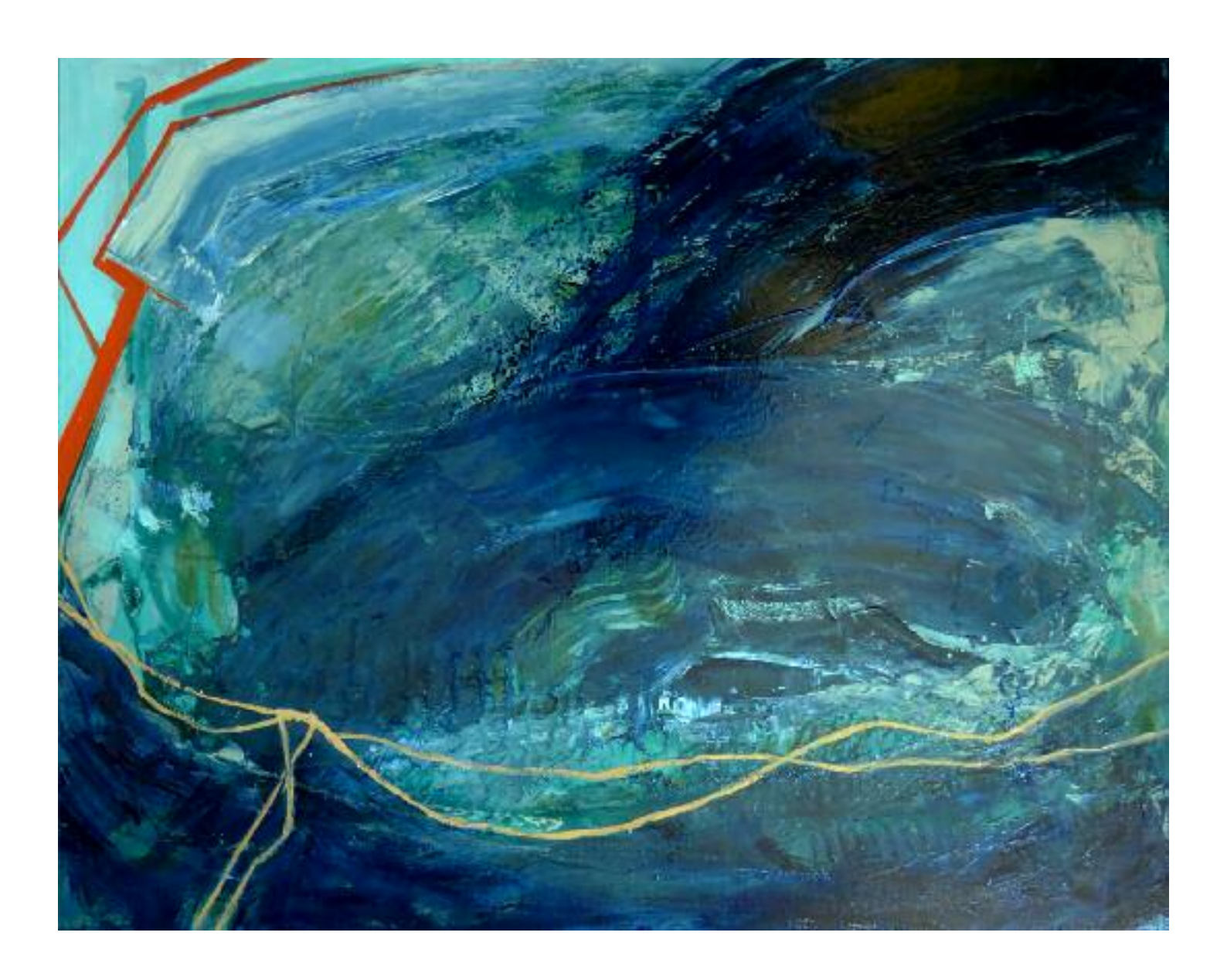
Sea Pool V, at High Tide (Bude, Cornwall) Oil 60 x 76 cms