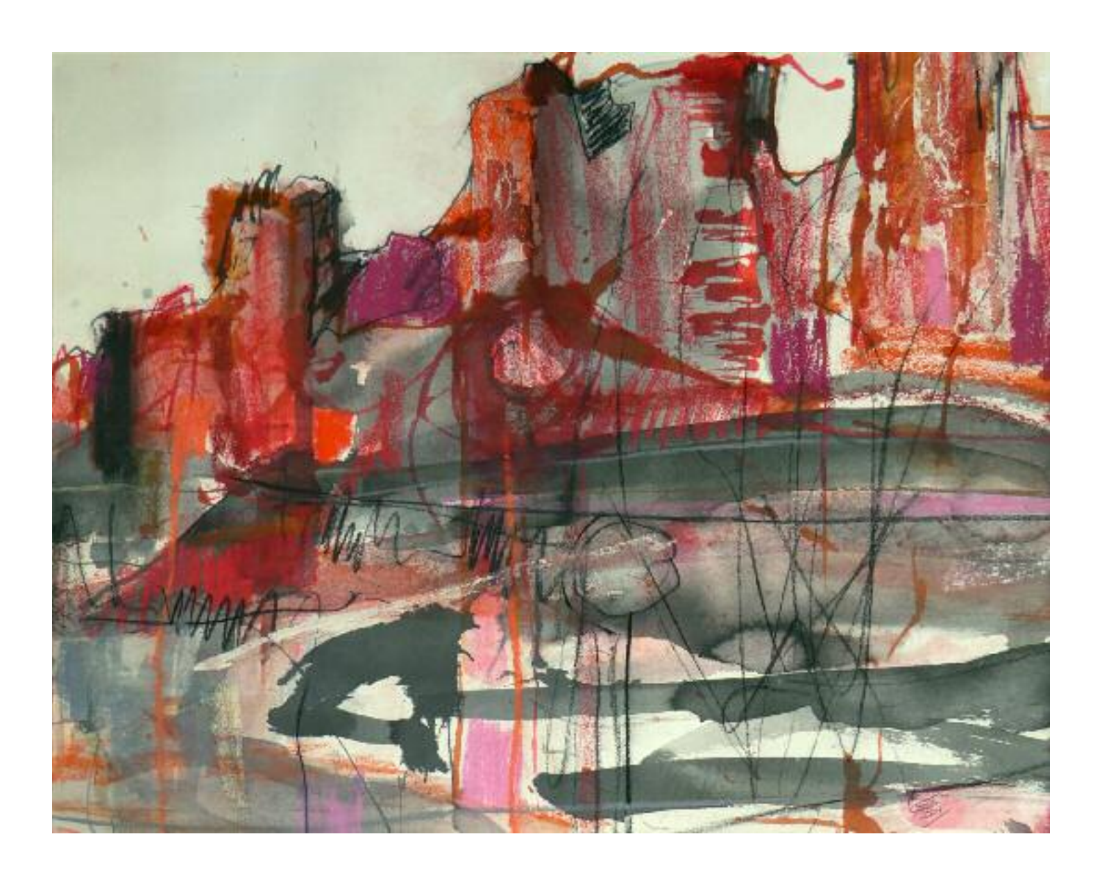
Study for MOAB III Landscape (Utah) Mixed Media 50 x 65 cms