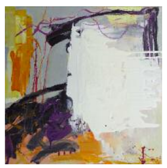
Big Yellow Taxi Oil 50 x 50 cms

My inspiration comes from the landscape around me and although my work is abstract, it always has references to the actual subject matter, even if they are not obvious. How do I make my art, what is my process? I do drawings and colour studies "Plein Aire" and take lots of photos which I then use back in the studio to paint, collage and sometimes print with. My paint is applied by building up layer on layer and painting wet into wet to give a rich and varied surface".