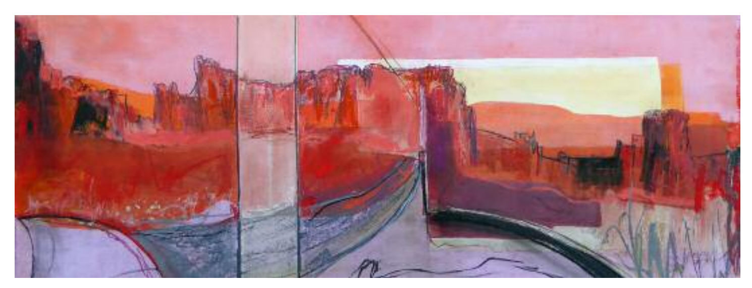
Study for MOAB Landscape (Utah) Mixed Media 30 x 82 cms