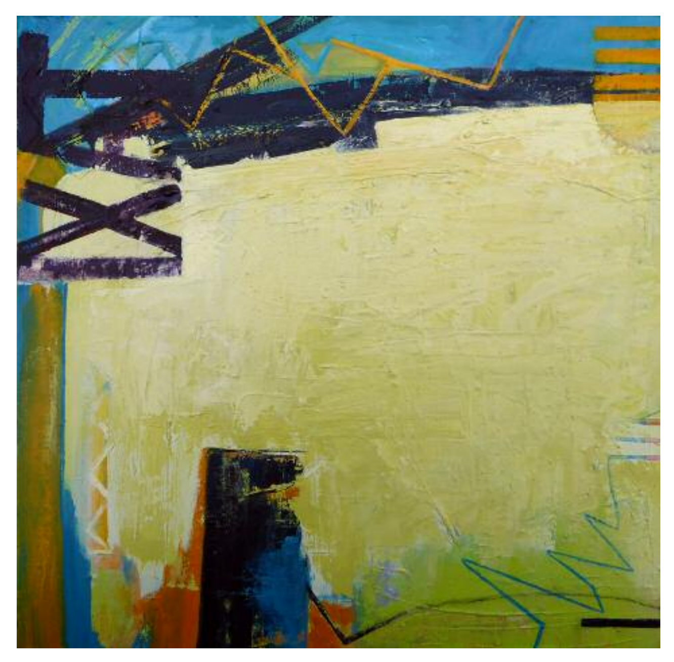
Estuary Revisited (Cornwall) Oil 61 x 61 cms