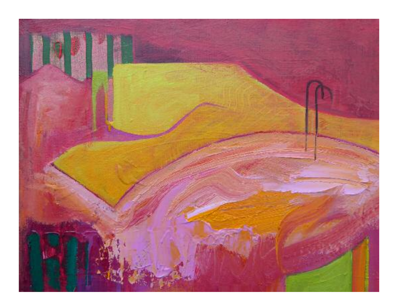
Geothermal Pool II (Penzance Lido, Cornwall) Oil 30 x 40 cms